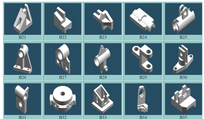
Fig. 1. DHS main window

The exercises, based on VR, are uploaded to a web platform called Draw Help System (DHS). When an exercise is selected, the application shows a piece in the virtual environment that allows its manipulation (movement, rotation or change of position etc.) so the user can become aware of all its details.