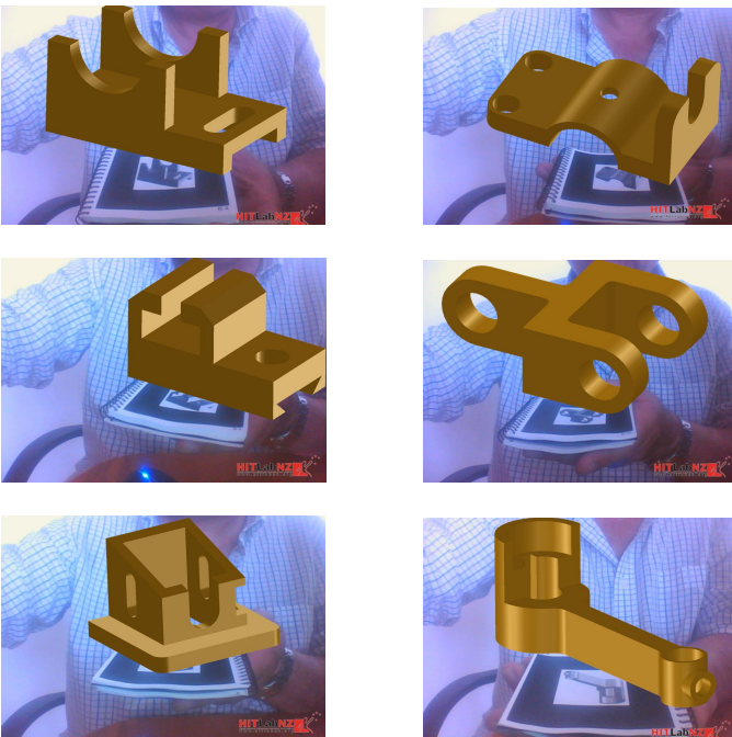
Fig. 3. Visualisation with Augmented reality.

All exercises and pieces were adapted to the format used by the BuildAR Pro augmented reality application [20], which allows the creation of scenes made up of a set of images or marks that codify a 3D model. When a scene is executed, a webcam connected to the PC recognises an image that is related to the 3D model and shows it integrated into the real world. A 'marks book' is also created, where the mark is composed by a frame and the exercise's image inside (Fig. 3).