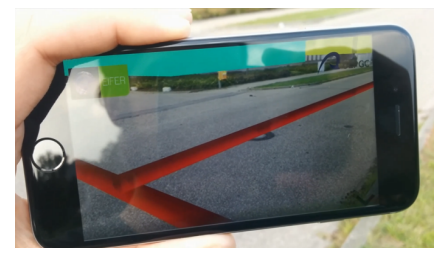
Figure 2, Underground infrastructure stored as CityGML visualised as AR on-site.

In the showcase, we will demonstrate the AR and VR visualization modes of the developed application. To that effect, we will present a dummy utility network from Zurich so it can be directly shown at the conference venue and participants will be able to interact with the application.