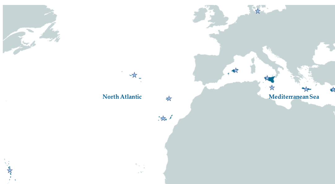
Figure 1. European islands selected for the study.

For this reason, we consider European islands and archipelagos as ideal and relevant destinations to conduct this research. Islands included in the study totalled ten: French West Indies (Martinique and Guadeloupe), Azores (Ilha de Sao Miguel), Balearic Islands (Mallorca), Baltic Islands (Fehmarn), Canary Islands (Gran Canaria), Crete, Cyprus, Madeira, Malta and Sicily (Figure 1). Total arrivals in this group were 52.9 million tourists in 2018, representing almost 9% of all tourism arrivals in Europe (EU-27 countries). This figure indicates the important role of these regions in the European tourism sector.